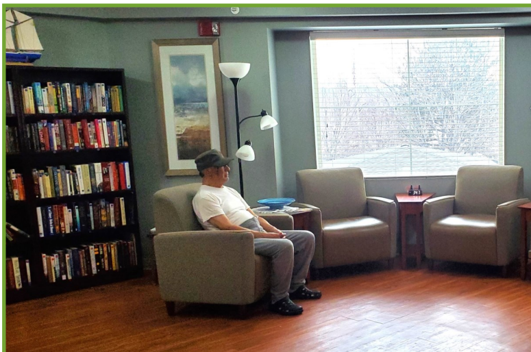
A Dayspring resident enjoying the upgraded library

The impact has been transformative. "I've noticed people that I've never seen look at books before, come and look at books," says Diana. "The way we've created the space, it's very functional for people to sit and talk."